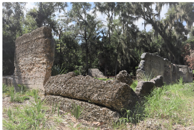
Tabby ruins of Jones' 1736 estate

Please allow a minimum of 1 hour and 30 minutes for your group program. Times vary according to group size. Large groups should plan to divide into smaller groups of 25-30 visitors. Please determine smaller groups ahead of time to get the most out of your experience. Programming is subject to change if group arrives late.